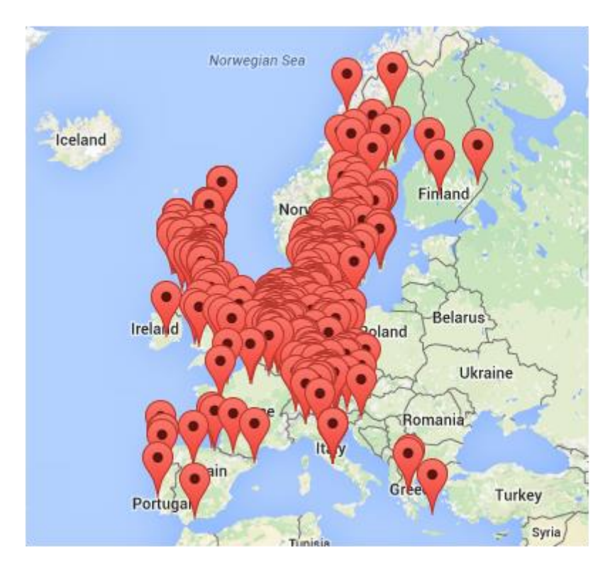
REScoops in Europe